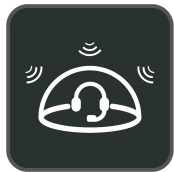
Four-Microphone Noise Cancellation

Yealink UH48 is a high-quality wired headset with ANC (Active Noise Cancellation) functionality. It is suitable for various office environments and offers a more immersive work experience.