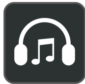
Brilliant Audio Performance